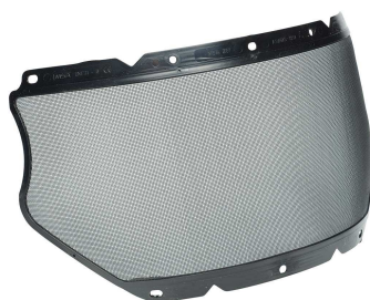
10155775- Mesh Visor for chin protection