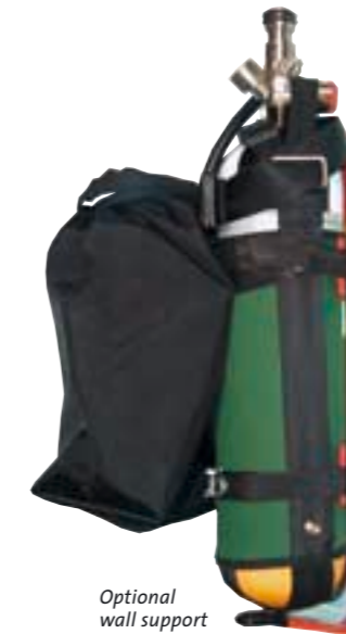
Optional wall support

The 3S is the most successful full face mask design in the world with over 5 million units sold. You can choose between standard or small size.