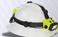
Rubber hardhat strap included

*Limited Lifetime Warranty • Product is warranted to be free from defects in workmanship and materials for the original purchaser's lifetime. The Limited Lifetime Warranty includes the LEDs, housing and lenses. Rechargeable batteries, chargers, switches, electronics and included accessories are warranted for a period of two (2) years with proof of purchase. Disposable, non-rechargeable batteries are excluded from this warranty. Normal wear and failures which are caused by accidents, misuse, abuse, faulty installation and lightning damage are also excluded.