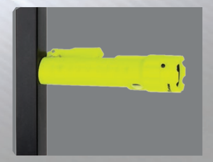
Hands-free magnet in base