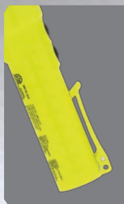
Built in pocket/belt clip