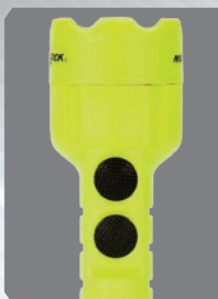
Dual body switches