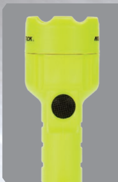
Single body switch