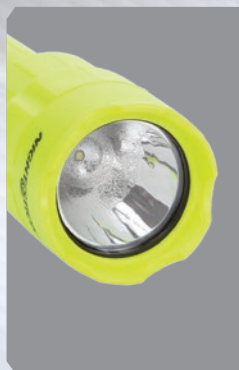
High-efficiency deep parabolic reflector