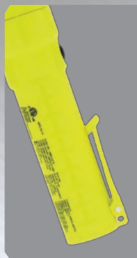
Built in pocket/belt clip