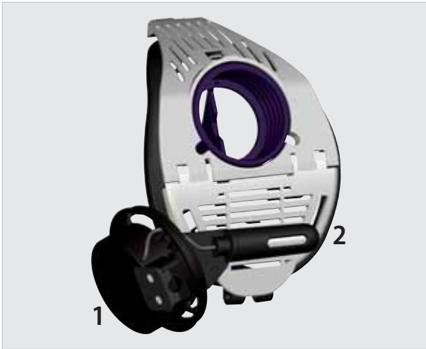
Separate loudspeaker (1) and microphone (2)

Loudspeaker and microphone are separated, but can be plugged into the adapter as one entity. This makes donning and doffing easier and improves the transmission performance.