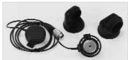
Communication system with adapters for 3S full face masks (negative and positive pressure)

For radio Kenwood TK 290 with LEMO coupling which offers the possibility to disconnect microphone/loudspeaker from PTT button during doffing equipment, without detaching from mask adapter.