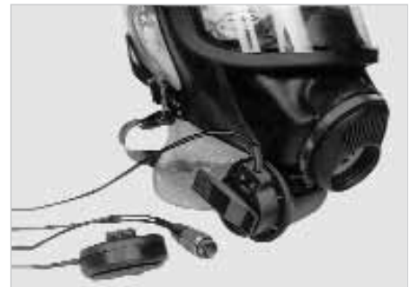
Communication system attached to 3S mask

Suitable configurations and compatibilities of PTT button with plug to your radio device you can find in our separate overview.