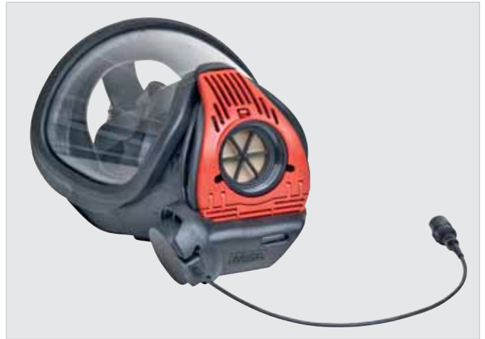
Ultra Elite ComKit with adapter (attached to Ultra Elite full face mask)

Suitable configurations and compatibilities of PTT button with plug to your radio device you can find in our separate overview.