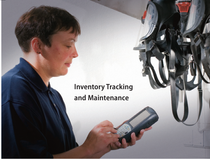
Inventory Tracking and Maintenance