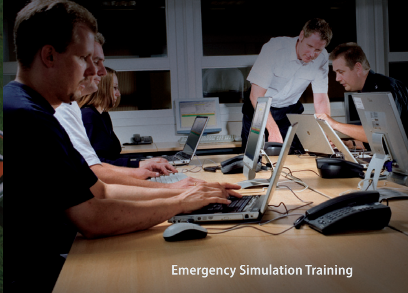
Emergency Simulation Training