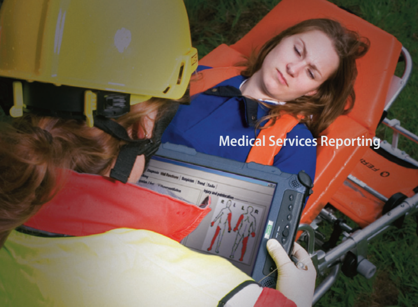
Medical Services Reporting