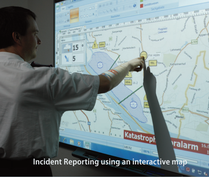
Incident Reporting using an interactive map

TecBOS.solutions is the software management system for all sectors of public and private safety management.